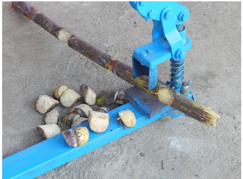
Sugarcane bud chopper

3. End-to-end mechanisation solutions: Farmers need access to a complete package of practices for specific crops, covering all stages of the value chain. For example, sugarcane growers could benefit from tools for tillage,