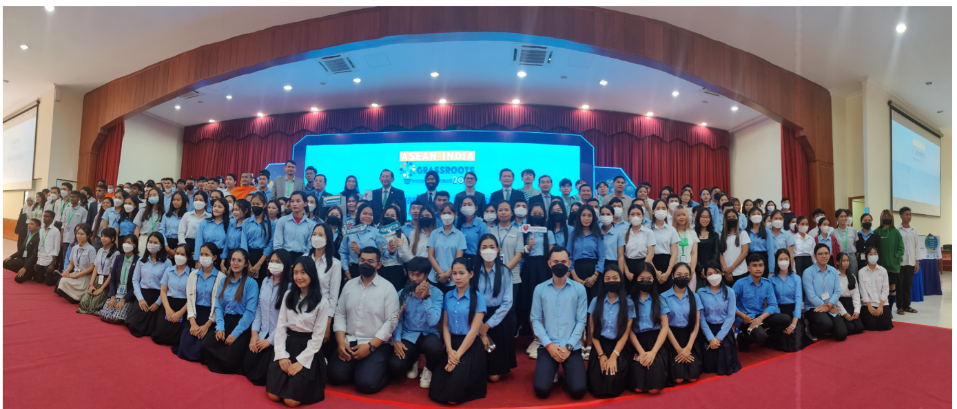
The grassroots innovators and student innovators from 10 ASEAN Member States (AMS) and India came together in Cambodia to celebrate the spirit of innovation during 3rd ASEAN India Grassroots Innovation Forum

Over a period of two and a half decades, NIF had scouted a variety of Science and Technology based innovations covering a variety of domains viz. energy, mechanical, automobile, electrical, electronics, household, chemical, civil, textiles, farm/ cultivation practice, storage practice, plant variety, plant protection, poultry, livestock management, human health, nutraceuticals etc. Upon scouting, the innovation life cycle demands value addition and Intellectual