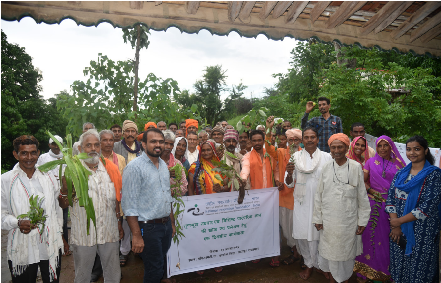
Workshop of herbal Healer at Bhamti village, Udaipur

technology can reach the masses. Farm fairs, cultural festivals, and exhibitions serve as natural meeting points where innovations are shared and documented. These traditional gathering spaces become platforms for knowledge exchange, where farmers and artisans can showcase their innovations and learn from others. What makes NIF's approach particularly noteworthy is its emphasis on ethical documentation. The institution places great importance on obtaining Prior Informed Consent (PIC) from knowledge providers, ensuring that innovators maintain control over how their knowledge is used and shared. This respect for innovators' rights has helped build trust and create sustainable