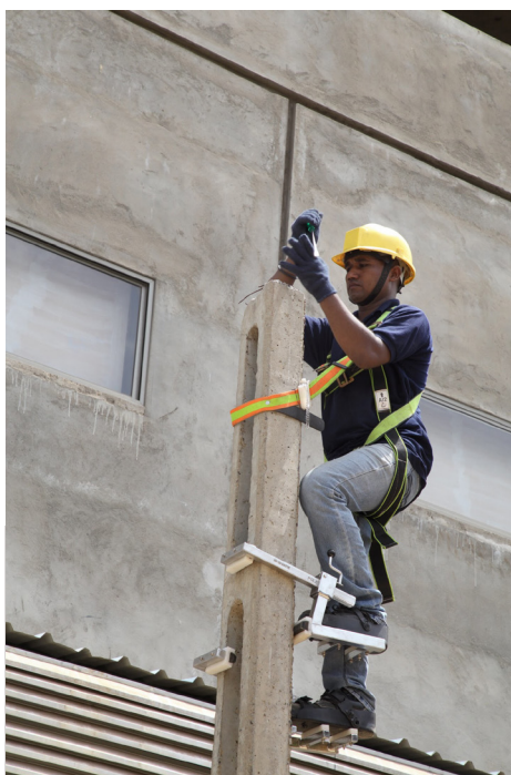
Need based Grassroots innovations for remote locations translating into strong business opportunities - The case of Pole Pro, an industrial safety device by a grassroots innovator from Kashmir valley

Property Rights (IPR) protection and in this regard NIF has filed 8 patents in USA as well, thereby maintaining a global perspective of things right from initial years. The next step entails business development of the technologies and to accomplish it, there are certain bespoke scenarios demanding bespoke solutions. In a given situation, where innovator expresses an interest in also being an entrepreneur, NIF has empowered them and in several hundred cases innovators have turned into successful entrepreneurs, with significant milestones like annual turnover to the tune of double digit crores. In this process, employment gets generated and country benefit in terms of tax collection, both direct and indirect. Moreover, a total of twenty-six start-ups have emerged through this mechanism. In other cases, where innovator believes that s/he is technically sound and would prefer someone external to be on-boarded for commercialization aspects, and this is true in cases where innovator is a student always and also common in grassroots innovator cases, NIF has successfully facilitated more than 130 cases of Technology Transfer which also includes licensees of the likes of MNC's, John Deere for instance (Tractor operated Paddy Transplanter), and also national champions like Vissco, India's leading manufacturer of orthopedic products who accepted Walker