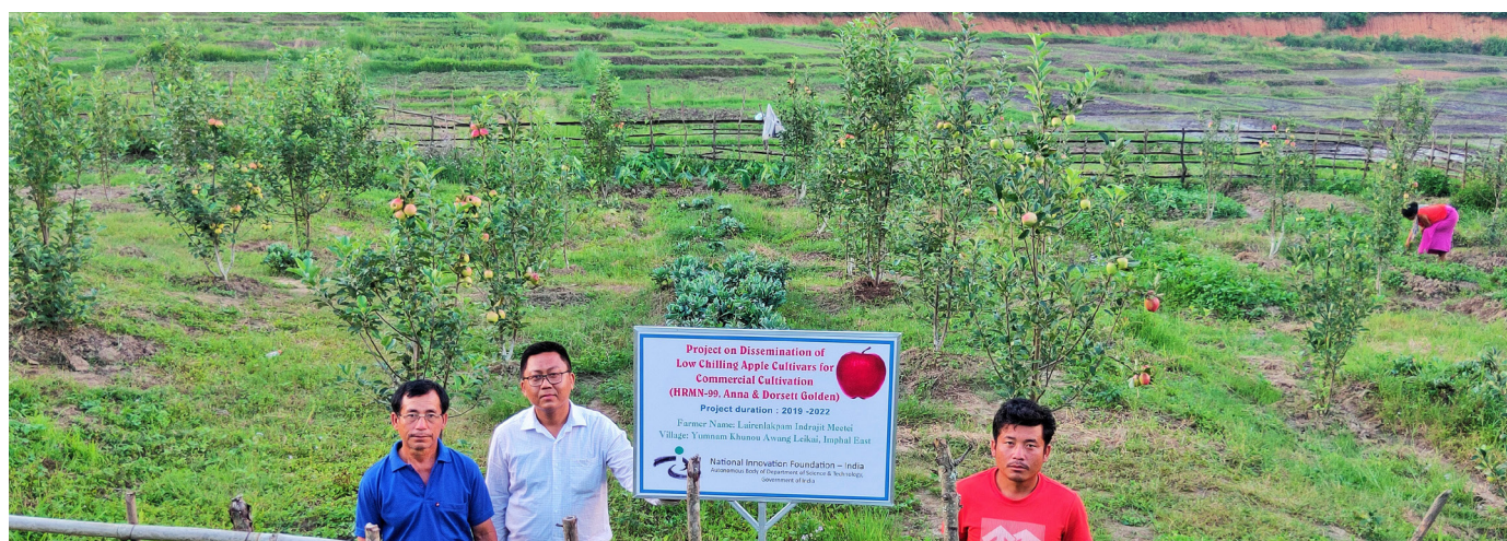
Dissemination of low chilling apple variety at Kakching, Bishnupur, Senapati, Churachandpur, Imphal East and Tengnoupal districts of Manipur

technical brochures. At the same time, electronic media plays a vital role via websites[i], online databases[ii], social media platforms[iii], and partnerships with online portals and national/international news outlets[iv]. Personal interaction is fostered through presentations, workshops, field visits, and Shodh Camps. Furthermore, NIF leverages strategic partnerships to amplify its reach. Notable collaborations in the past have included working with the Indian Postal Department to display informational posters in Gujarat villages, partnering with IFFCO Kisan Sanchar Limited to deliver voice-based agricultural