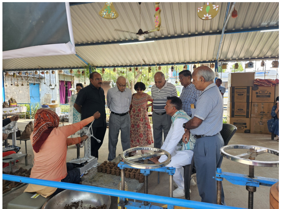
Innovator explaining technology to experts at site

Over the past 25 years, NIF-India has introduced and successfully