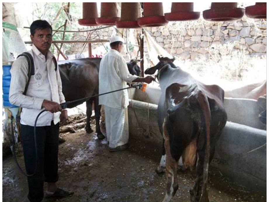
Fig Method of application on external parasite-infected animal, Pune district, Maharashtra

search for non-agriculture activities are visible hence there is need to demonstrate evidences