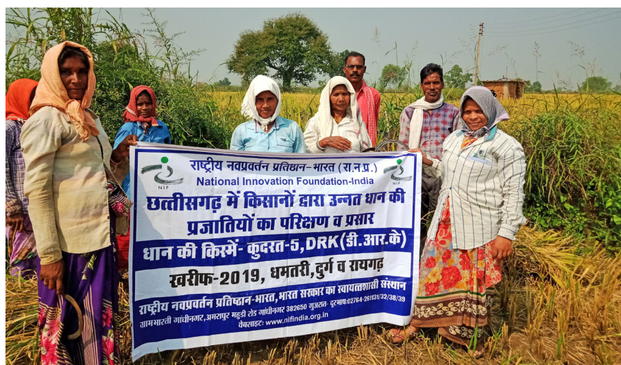
Demonstration trials of farmers rice varieties (DRK and Kudrat-5) in Durg, Dhamtari and Raigarh districts of Chhattisgarh

manufacturing, and incremental innovation. NIF also promotes co-creation, offering core innovative components and empowering users to adapt and build products based on local resources. Emphasis is placed on designing easily serviceable products, utilizing readily available materials, and standardizing training modules for operation, maintenance, and product development. To further facilitate adoption, NIF has developed several DIY manuals of grassroots innovations with detailed technical instructions for