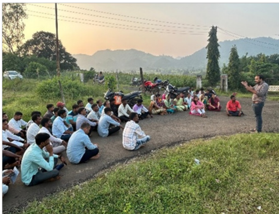
Sensitisation program at mulgi parisar, Nandubar district, Maharashtra for village youth for scouting and documentation of Grassroots innovations

Young minds play a crucial role in this scouting process. Through student internships and survey programs, NIF engages college students in scouting innovations in their own villages. This not only helps uncover hidden talents but