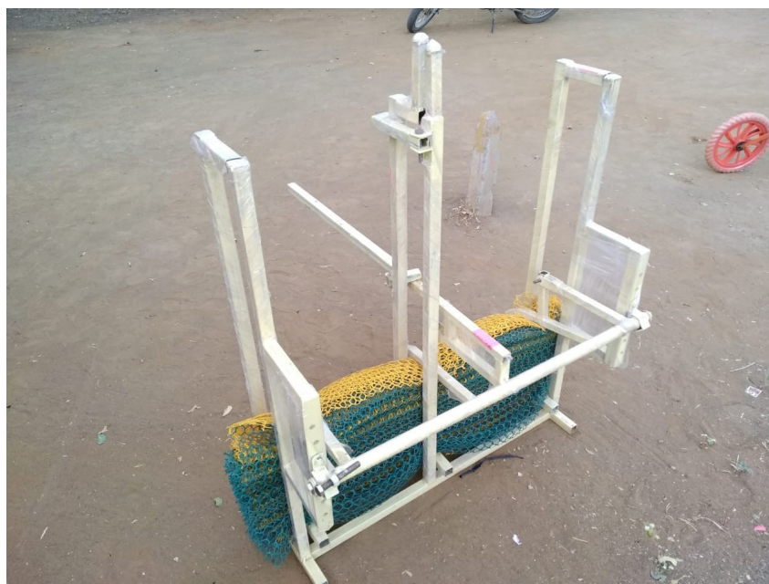
Silk worm net folding device

7. Development of smart agricultural machinery: Prototypes of smart machinery have been devel-