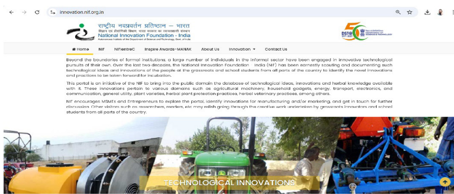
The road ahead

Since its establishment, NIF has been at the forefront of leveraging ICT to identify and promote innovations. Several key areas highlight how ICT has been integrated into NIF's operational framework. Grassroots Innovation Database is created with thousands of innovative ideas. The digital platform is accessible to researchers, policymakers, and entrepreneurs. NIF has launched web portals where grassroots innovators can submit their ideas for evaluation. This eliminates geographical constraints, allowing widespread participation from remote villages to urban centers. With the help of ICT, NIF assists grassroots innovators in obtaining patents for their ideas. Patent management systems streamline the process, ensuring timely protection of intellectual property rights. NIF organizes online workshops, webinars, and e-learning programs to train grassroots innovators on entrepreneurship, business development, and technical