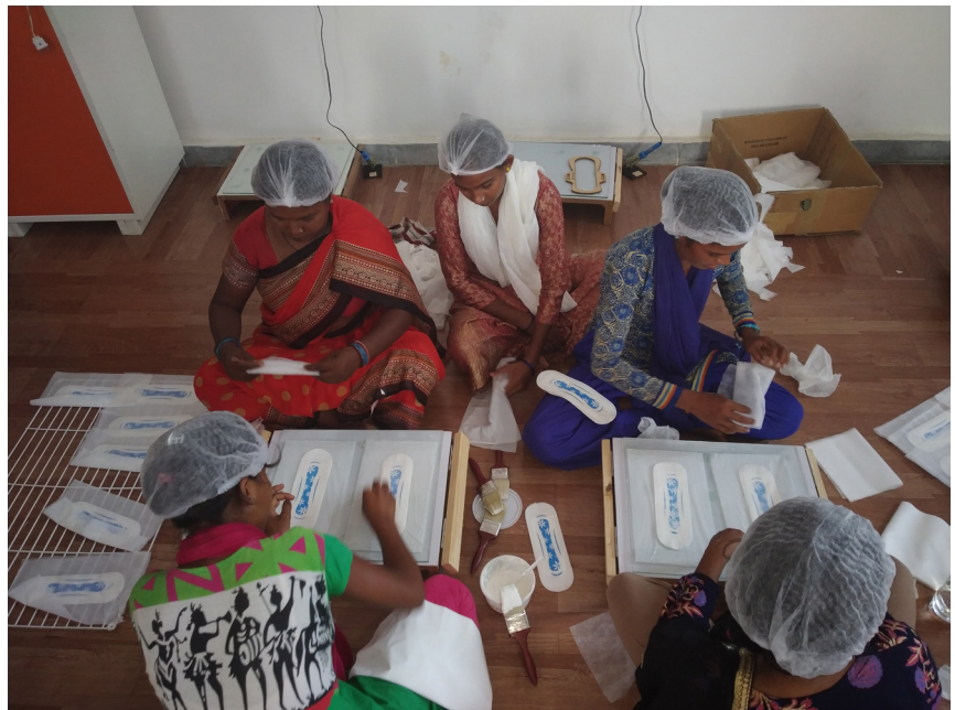
Training to women belonging to SHGs by NIF for producing sanitary napkins

The success of NIF’s dissemination and diffusion strategies is gauged through several key