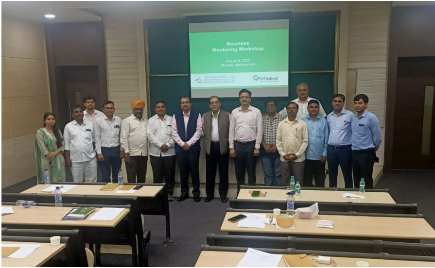
NIF Incubation and Entrepreneurship Council (NIFentreC), a Technology Business Incubator (TBI) hosted by NIF which contributes towards strengthening of commercialization aspects of innovations

review the journey of two and a half decades, we realise that NIF was perhaps the only Institution in the country at the time of its inception which provided a truly an end to end service to its supported innovators. This is evident in diversity of metrics that NIF represents, as stated above and also in other contemporary indicators, be it the count of start-ups nurtured or the count of patents it managed to get granted or count of innovators recognized or count of those which were successfully value added in terms of Science and Technology. Conventionally, these metrics used to be one dimensional for specialized institutes which provided only one and not all of these services simultaneously. However, NIF managed to challenge the conventional approaches and gradually, this uniqueness of NIF to serve end to end was adopted by few Institutions in the country over a peri-