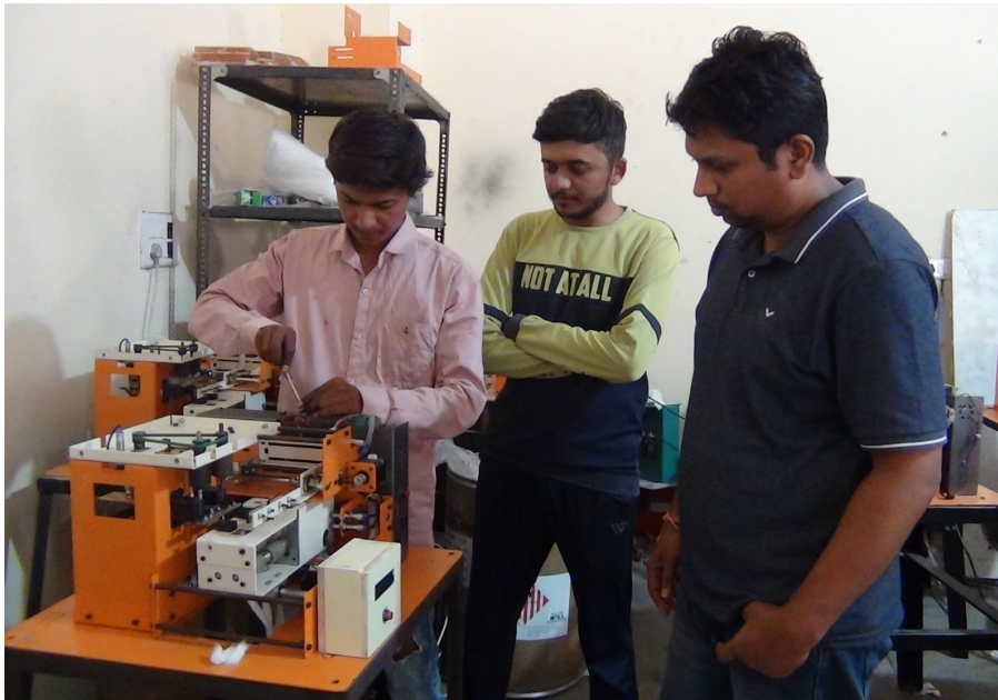
NIF Engineer at Inovator's Site

extend services at their doorstep b) arranging experts visit at the site for an exchange of ideas, c) extending direct financial support for value addition by innovators d) arranging innovators' visits for prototype development or pilot scale production at fabrication lab at NIF-India e) establishment of community workshops at innovator's place, f) arranging exposure visit of innovator at public and private R&D Labs g) arranging interaction of top experts and policymakers under one roof in Innovation Scholar's In-residence programme h) continuous engagement with a diverse range of stakeholders, including innovators, fabricators, entrepreneurs, and end-users of innovations h) regional offices of NIF-India across different parts of the country - Jammu and