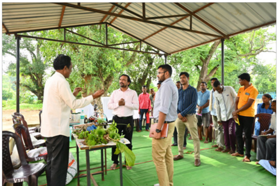
Interaction with herbal healer in village meeting at Bijapur district, Chhattisgarh

areas. Local knowledge systems help in seeking solutions to such problems in a spontaneous manner individually or collectively.