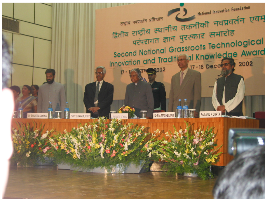
Respecting, Rewarding and recognizing creative spirit - Second National Grassroots Technological Innovation and Outstanding Traditional Knowledge award of NIF (2002)