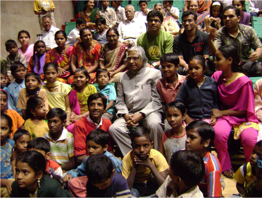
Hon'ble former President of India Dr APJ Abdul Kalam inspiring creative and innovative children with his presence during IGNITE Awards

out their scientific validation with the support of various partner Institutions in the Public sector and expert organizations in the Private sector. Consequently, the indigenous practices maintained over generations which had proven useful to common people and generated significant social impact locally, get an opportunity to be preserved, professionally and scientifically evaluated as per standards and protocols, scaled up and benefit the entire country and world at large through their inherent merit. Enhancing citizen welfare, social wealth, improving people's lifestyles and facilitating sustainable alternatives for development were successfully accomplished.