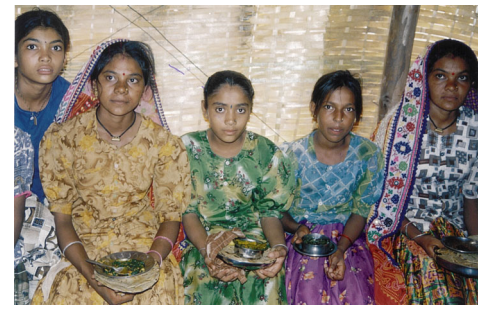
Participants of the recipe contest organised during the seventh Shodhyatra , Dabhuda to Sarasla, Kutch, Gujarat

National Innovation Foundation Annual Report 2001-2002