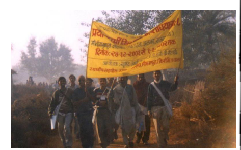
Eighth Shodhyatra, Bhikampura to Nilkanth, Rajasthan